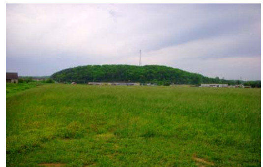
This open area behind the Visitor's Center is about to Transform