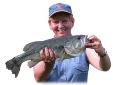
One That didn't get away!

Don't forget the Chamber Meeting is not until August 3rd— 7:00 pm— Tellico Plains Community Center