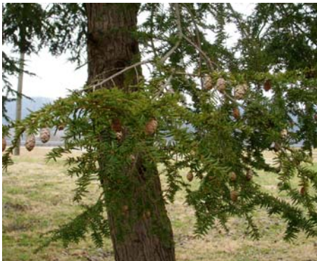
Healthy hemlock in Tellico