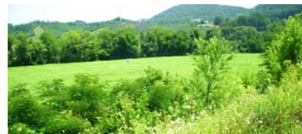
The dream of a Tellico River Community Park still lives and can become a reality