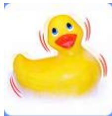
Get involved in the Duck Race

The Chamber would like to thank everyone who helped make the Candlelight Walk a success this year. From a great work done by the Cherokee Women's Club and other volunteers.