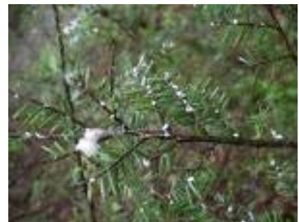
Infestation on our trees